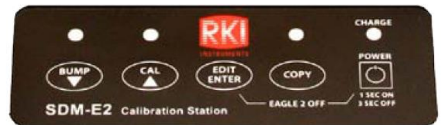
Control Panel View